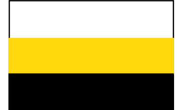
PERAK 1879-CIRCA 1896 (see p. 40)