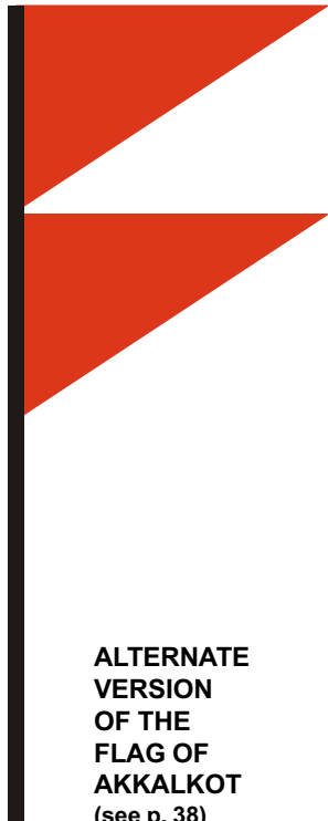
ALTERNATE VERSION OF THE FLAG OF AKKALKOT (see p. 38)