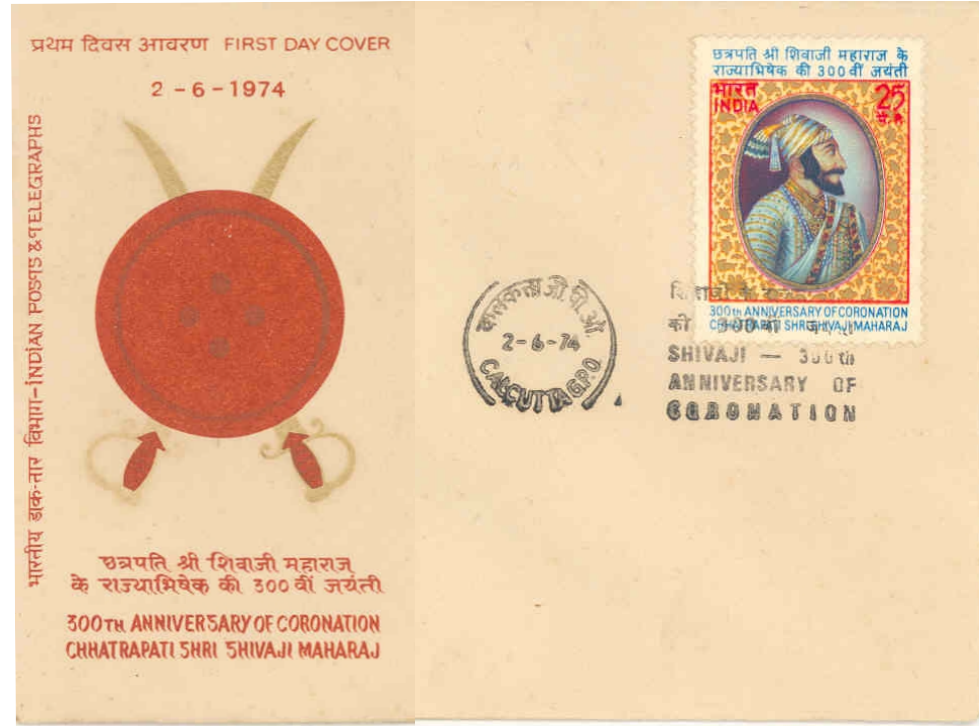
COMMEMORATIVE COVER HONORING SHRI SHIVAJI CHHATRAPATI, FOUNDER OF THE MARATHA EMPIRE OF WHICH AKKALKOT WAS A PART (see p. 37)