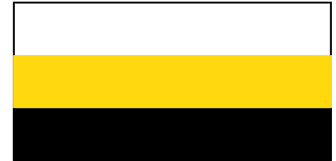
PERAK CIRCA 1896-PRESENT (see p. 40)